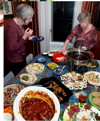
Beat the Blues