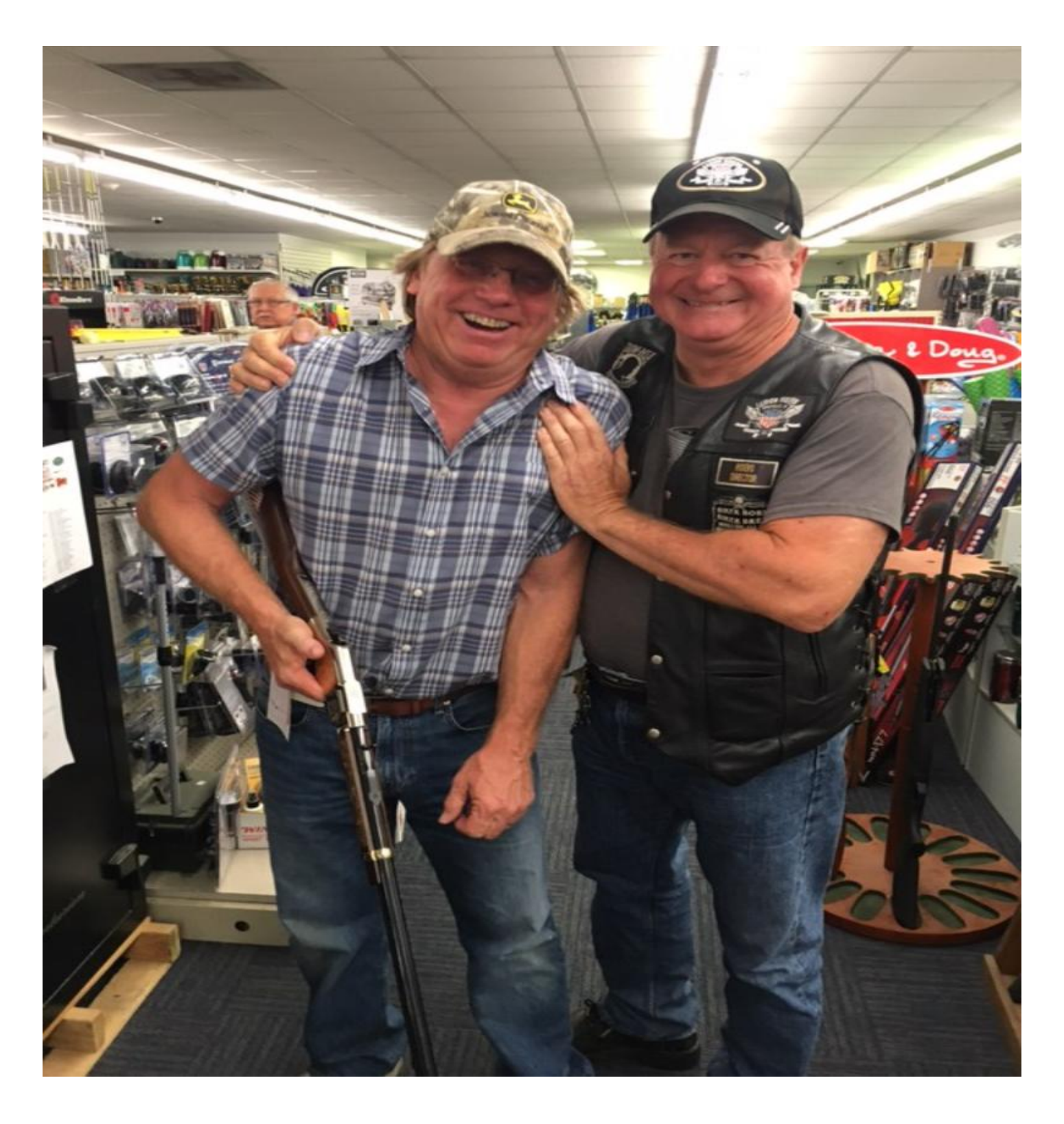
WINNER OF THE GUN RAFFLE