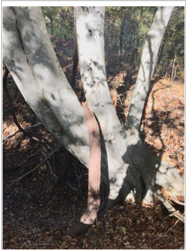
Large grape vine in a tree vise grip!