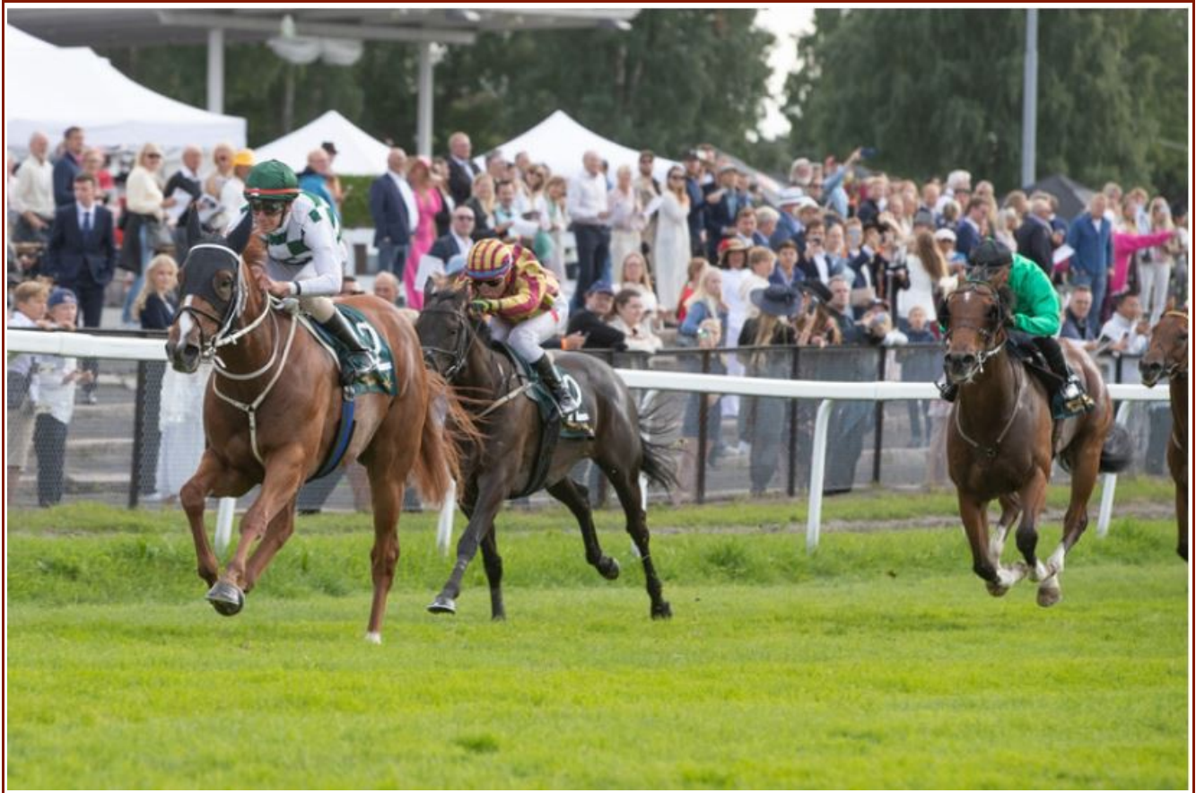
Admiral de Vega impressing on Derby day

Admiral de Vega, yet another talented son of Lope de Vega, won three of his five races last year and those three wins have one thing in common; they were gained in events that have worked out tremendously well. While improving with each start, Admiral de Vega was beating horses that were either coming off career best efforts or moving onto career best efforts in their subsequent starts. Normally, it's easy to pick a hole or two in handicap races – not so when it came to those Admiral de Vega won. Nor the 3yo contest that set the ball rolling, for that matter. It was all rock solid, and who know what this four-year-old can achieve in 2023. There are no guarantees in this sport, and to say that he absolutely will continue improving at four would be folly, though it does appear likely that he will.