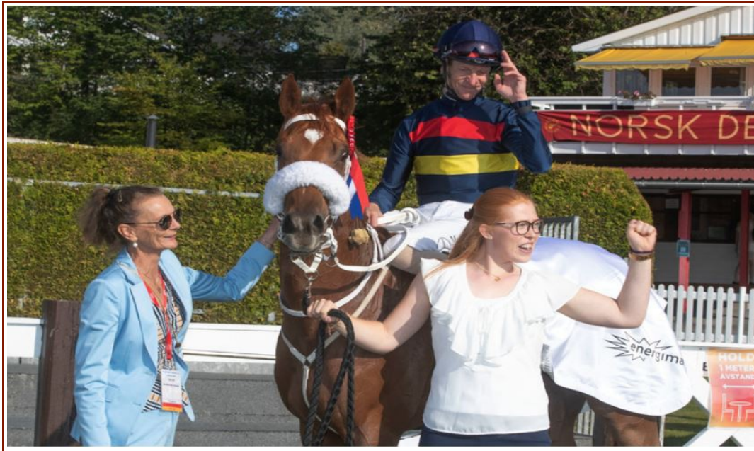
Derby day winners!