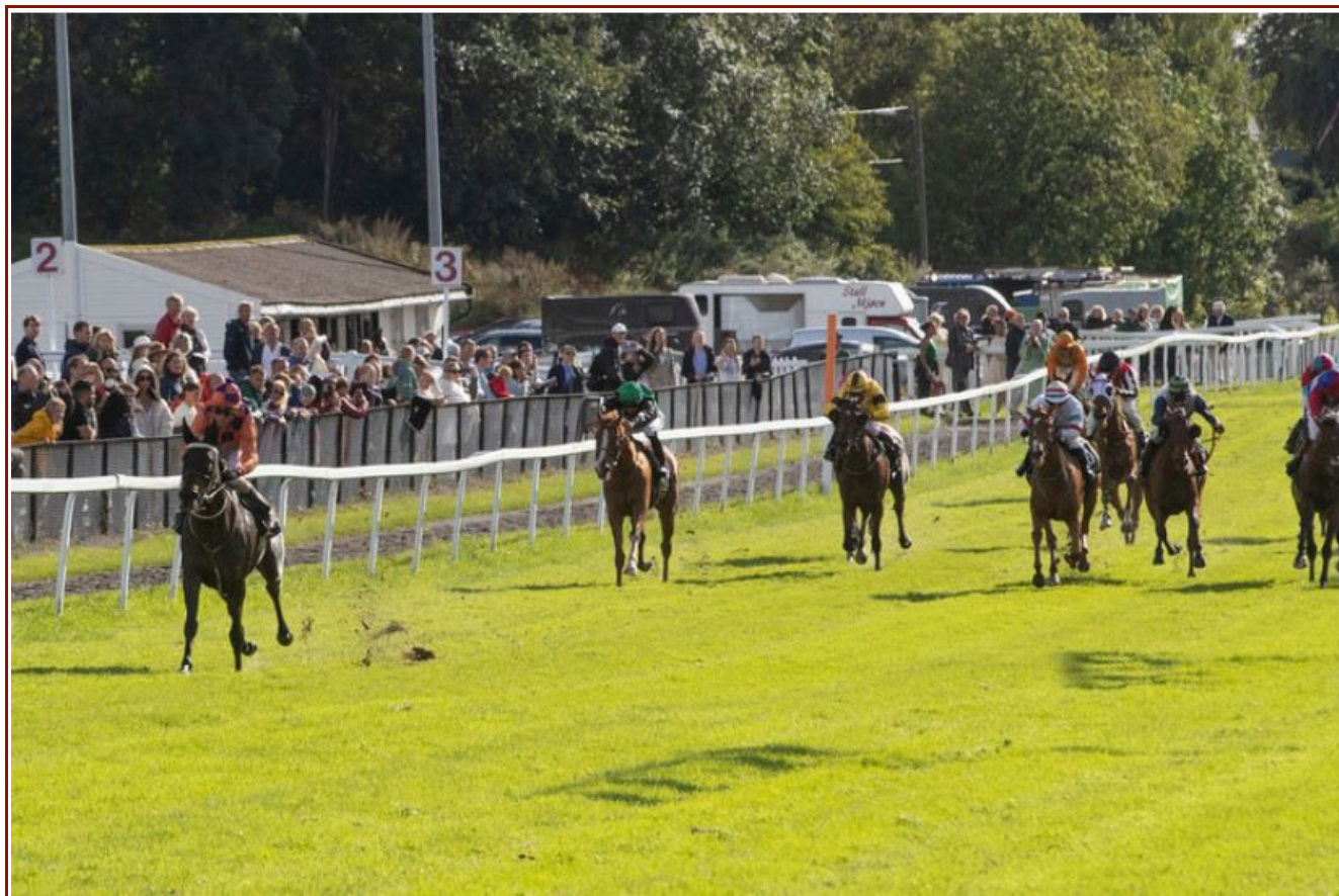
I Rest M Case winning Drømmemilen with ridiculous ease.

I Rest My Case earned more prize money than any other horse in running in Norway last year, when she won the valuable Drømmemilen on Derby, picking up 312,000 kroner after what looked like a racecourse gallop, and the historic Brukseier Eivind Lyches Minneløp – an important event for homebred horses. She was also runner-up in the Breeders' Prize, Skandinavisk Mesterskap and against imports in the Derby Trial, a performance that posed the question “should she go for the Derby?”. Well, she didn't – instead taking in the mile race on Derby day, which she won with ridiculous ease, cantering home by 15 ¼ lengths from No Compromise. It was as hard to assess the value of this form as it was not to be impressed by the performance. I Rest My Case won the race with such ease and it would have taken a very good horse to keep up with her on this occasion. Her win in Lyches Minneløp was also a bit of a stroll, as she outclassed her rivals to win the 1980-metres turf contest by 5 ¼ lengths. Buckybelle finished second, and Queen of Antaktis filled third place, beaten almost nine lengths. This was also a case of I Rest My Case being far too good for her rivals. >>>