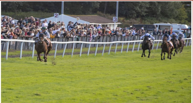
Norwegian Derby 2022: Hard One To Please demolishing the opposition.

The next test would be a lot more informative. Hard One To Please was being pointed at the valuable Stockholm Cup International (G3) at Bro Park in September, when he would be facing older horses. The Cup, often billed as Scandinavia's 'Arc', drew a solid field of 15 runners. Amongst them was the German trained Virginia Storm, who had run third to Prix de l'Arc winner Torquator Tasso and second to German Derby runner-up Alter Adler at home. Virginia Storm's best form made him one to fear. Then we had Outbox, flying the English flag for a second time at Bro Park, having run such a good second in the 2021 edition of the Stockholm Cup, Oslo Cup (G3) winner Quebello and local hero Espen Hill.