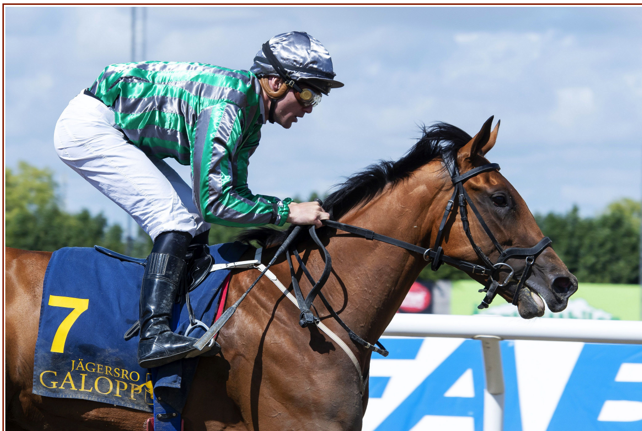
Takeko winning the Wettermarks on Swedish Derby day.

Takeko enjoyed a productive season in 2022, stepping up nicely on her form as a three-year-old in 2021. when she was runner-up in the Norwegian 1,000 Guineas and won the Giant Sandman Cup. Her four-year-old exploits were even better, with the peak performance coming when she landed the Margareta Wettermarks Minneslöping on Swedish Derby day at Jägersro. Switching to dirt, after having finished second to Iron Butterfly when making her seasonal debut in the Nagell-Erichsens Hoppeløp at home and filled the same place behind Ascot Brass in the Bloomers' Vase (LR) at Bro Park, Takeko proved much too good for her nine rivals in the 1730-metres long Wettermarks. She stayed on strongly at the finish and won most comfortably by 2 lengths from Thunderey, who beat Numeira by a head for second. Aperola occupied fourth place, beaten 7 lengths by Takeko, and the entire field was strung out to the tune of almost 25 lengths.