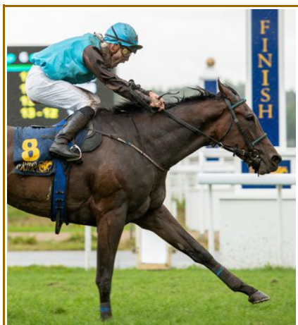
Good Fortune.