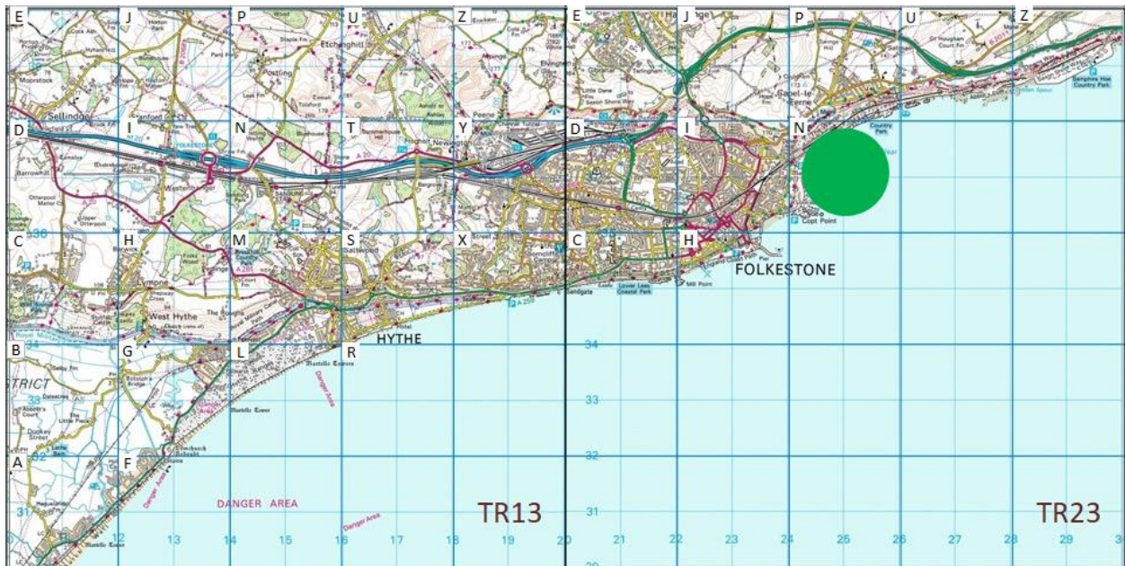
Figure 2: Distribution of all Lesser Crested Tern records at Folkestone and Hythe by tetrad

Figure 2 shows the distribution of records by tetrad.