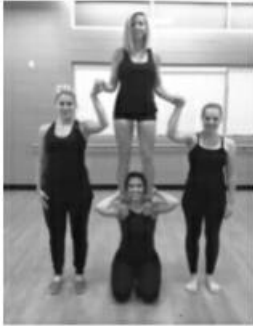
LEGAL SHOULDER STAND