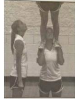
ILLEGAL SHOULDER STAND

C. Pyramids, Hanging Pyramids, Totem Poles, Roll Down T Lifts, Backward Leap Frog and Leap Frogs, (found in Rule 4 section 4 NFHS rule book.)