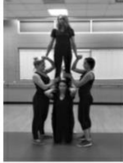
ILLEGAL SHOULDER STAND