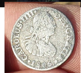
Personal Oldest Coin dug in 2015 Submitted by: David Bond 1805 Mexico City 1/2 Reale, Nacaise, MS