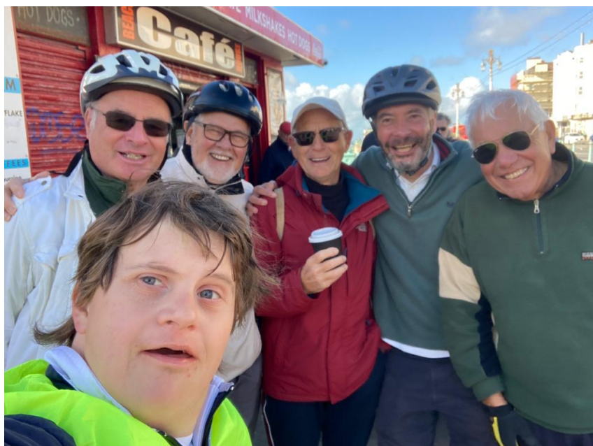
Refuelling before returning to base!!