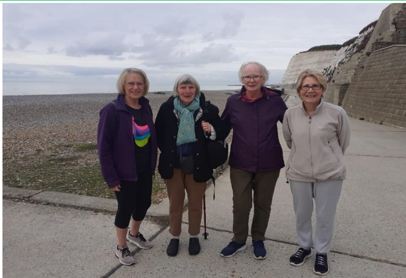
Breakfast Ladies – At the start!