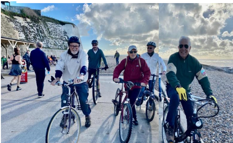
Enjoying the ride!