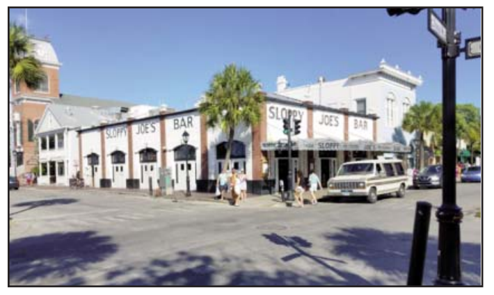
Sloppy Joe's Bar in Key West where Hemmingway prevailed.

Pictured on these two pages are more convention photos taken by your Editor at the COA convention in Key West. It is sort of sad to think that much of what we encountered outside the hotel is not there now. I have included some Key West favorites I took before the convention and then a batch of photos at the convention. Enjoy!