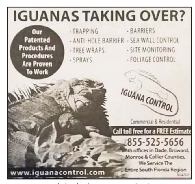
A solution for those overgrown lizards.