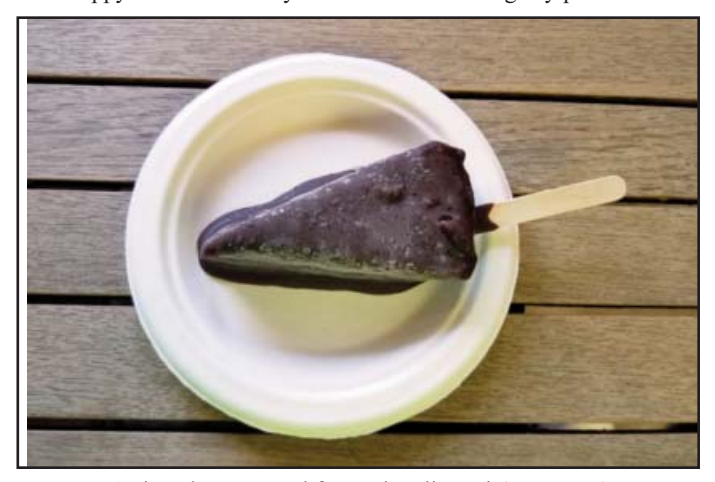
A chocolate-covered frozen key lime pie! Yummy!