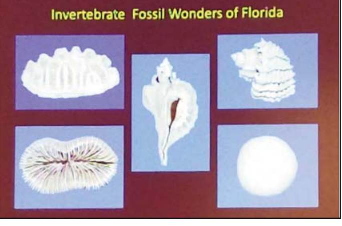
The beginning slide of Garys workshop.