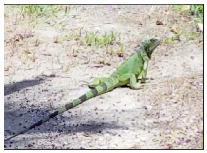
Gracie, our golden, had fun with these overgrown lizards!