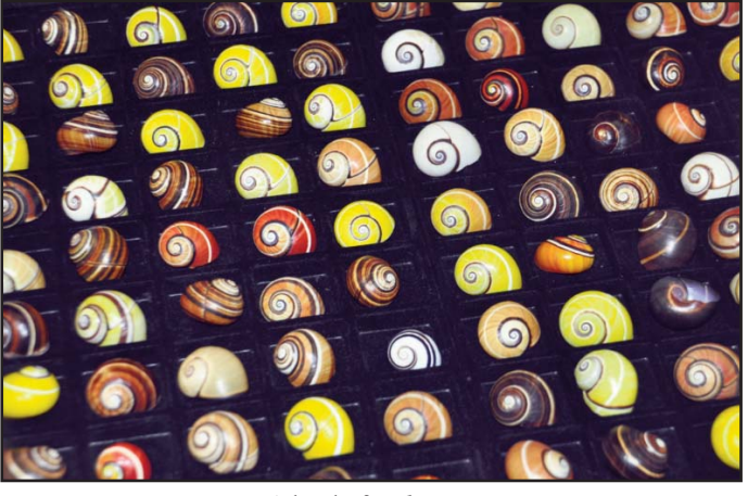
A herd of Polymita.