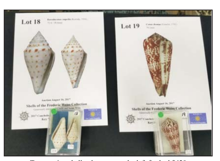
Two auction shells: the cone on the left fetched $420 and the one on the right $190.