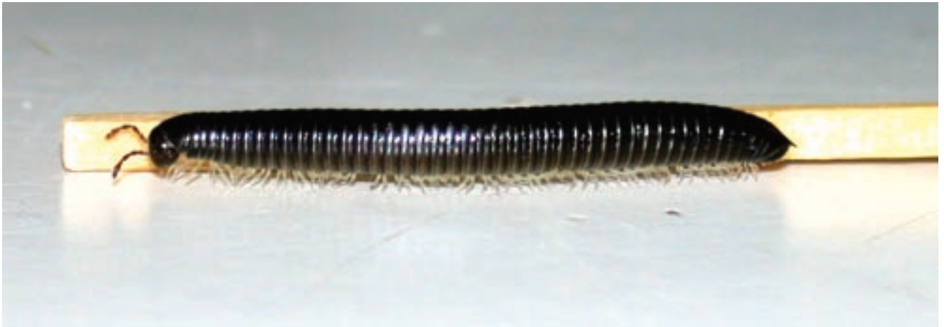
Figure 3. Uncoiled millipede in motion.