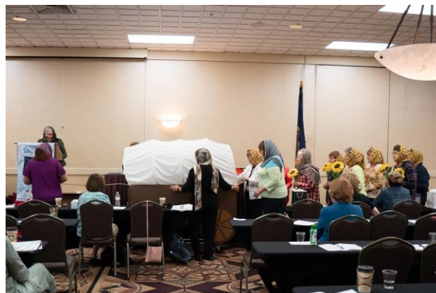
The covered wagon crosses the Kansas prairie...