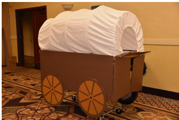
The Conestoga wagon