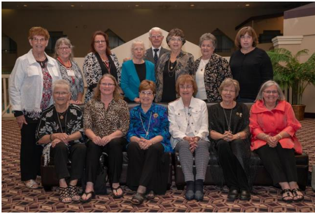
Our Kansas attendees.