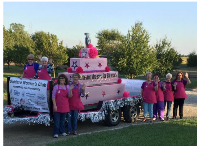
Club Float for the Goddard Fall Festival Parade