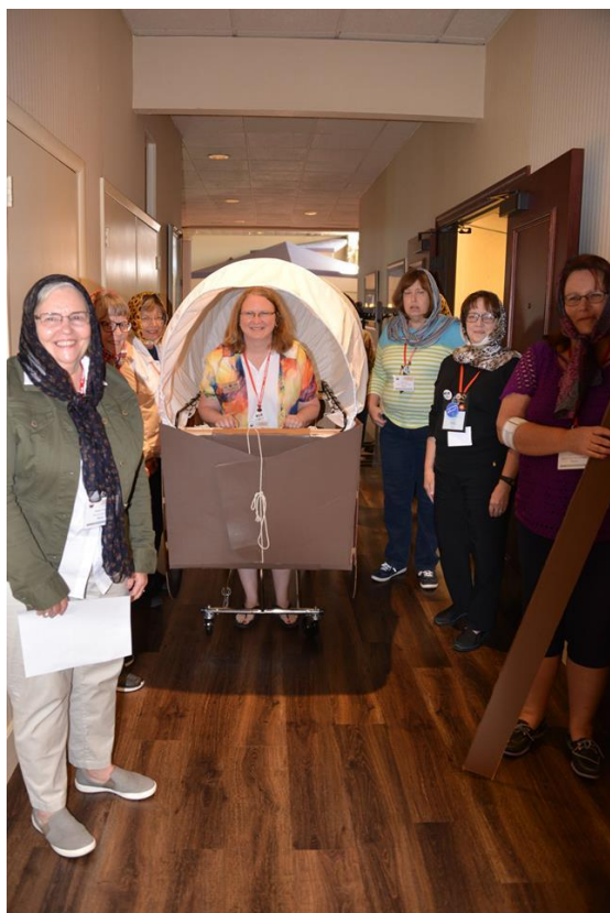
The Kansas pioneers waiting for their entrance.