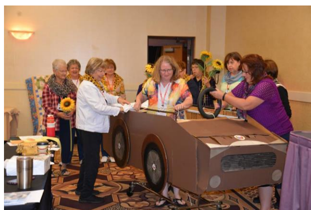
And transforms a convertible.