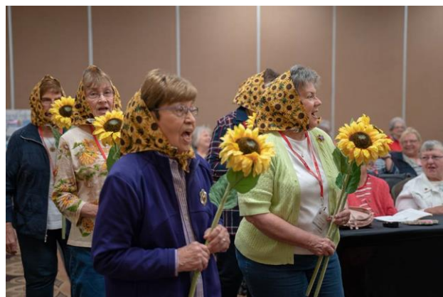
As we sing "Home on the Range"...