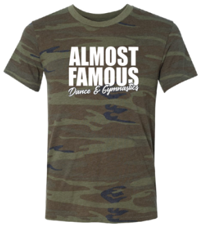
Alternative Camo Shirt Youth Sizes: YS YM YL YXL Adult Sizes: AS AM AL AXL A2XL A3XL