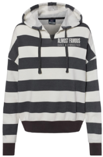
Women's Boxy Hooded Sweatshirt Adult Sizes: AS AM AL AXL A2XL