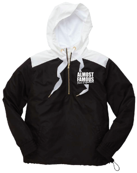
Quarter Zip Jacket Adult Sizes: AXS AM AL AXL A2XL A3XL