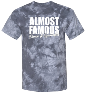
Silver Tie Dye Shirt Adult Sizes: AS AM AL AXL A2XL A3XL