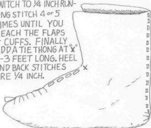
19 th CENTURY UTILITARIAN

SWITCH TO \frac{1}{4} INCH RUN- NING STITCH 4 or 5 TIMES UNTIL YOU REACH THE FLAPS or CUFFS. FINALLY ADD TIE THONG AT "X" 2-3 FEET LONG. HEEL AND BACK STITCHES ARE \frac{1}{4} INCH.