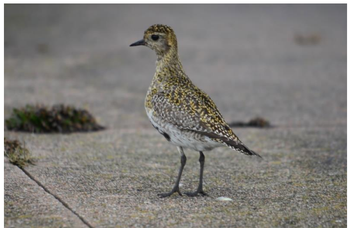
Golden Plover at Samphire Hoe