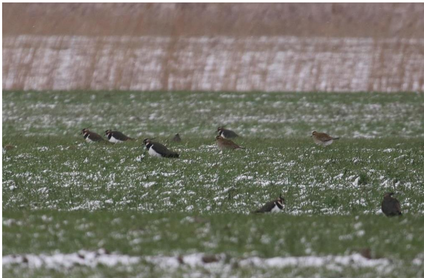
Golden Plovers with Lapwings at Donkey Street (Ian Roberts)

Returning birds have been noted as early as the 17 th June (2001), when one was seen at Nickolls Quarry, increasing to three there on the 25 th June, with one also the 7 th and 14 th July 2001, but the only other sighting in July related to one at the same site on the 23 rd July 1999. Wintering birds generally arrived from the second week of August and numbers could rapidly increase, with 160 in the Botolph's Bridge area on the 14 th August 1998.