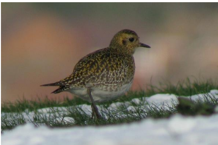
Golden Plover at Copt Point (Paul Trodd)

The Kent Bird Report for 1964 stated that 120 flew north-west over Folkestone on the 27 th December, part of a cold weather movement that also involved 800 Lapwings, but there were no further reports until 1979 when Dave Weaver noted it as "present" at Nickolls Quarry on the 23 rd January 1979, with four at the same site on the 23 rd December later the same year, and subsequent sightings of one there on the 2 nd March 1982 and five there on the 19 th February 1983.