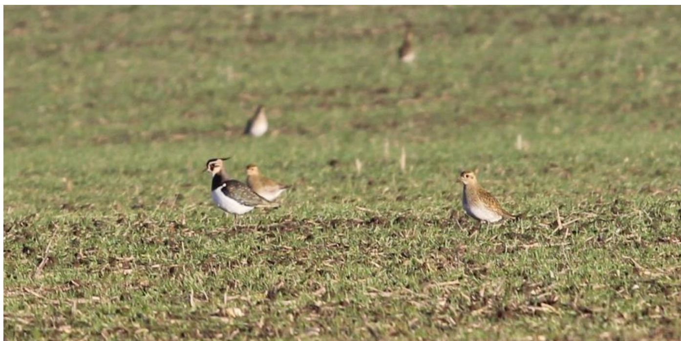
Golden Plovers with Lapwings at Postling Wents (Ian Roberts)

A wintering flock was first noted in the Capel-le-Ferne area in November 1988, when 250 were present, and there were sightings there in five of the next eight winters, with peak counts of 700 on the 31 st December 1992 and 31 st December 1996.