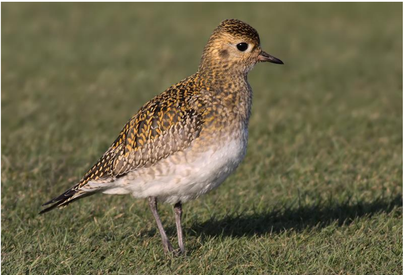
Golden Plover at Hythe Imperial Golf Course (Brian Harper)