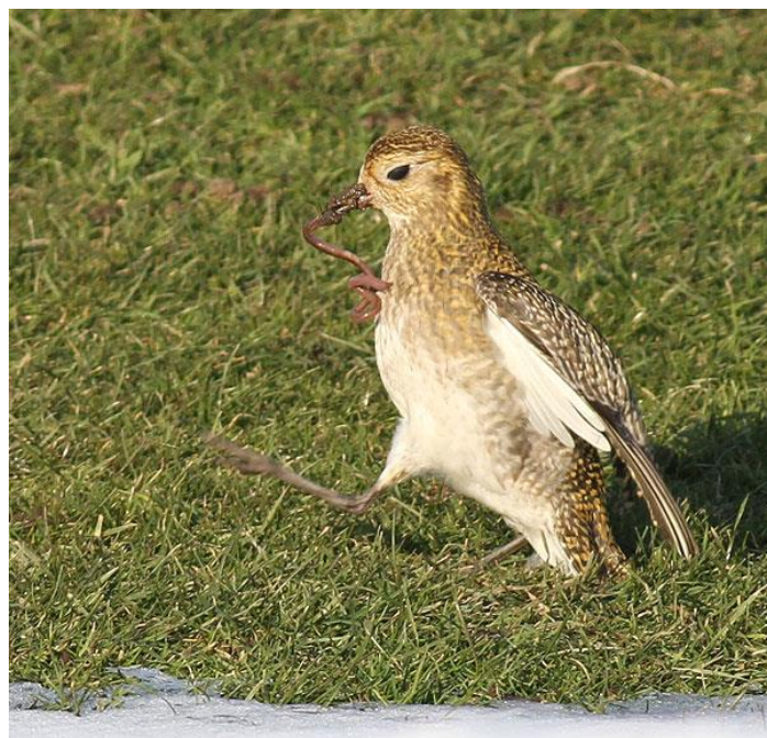
Golden Plover at Hythe Imperial Golf Course (Brian Harper)