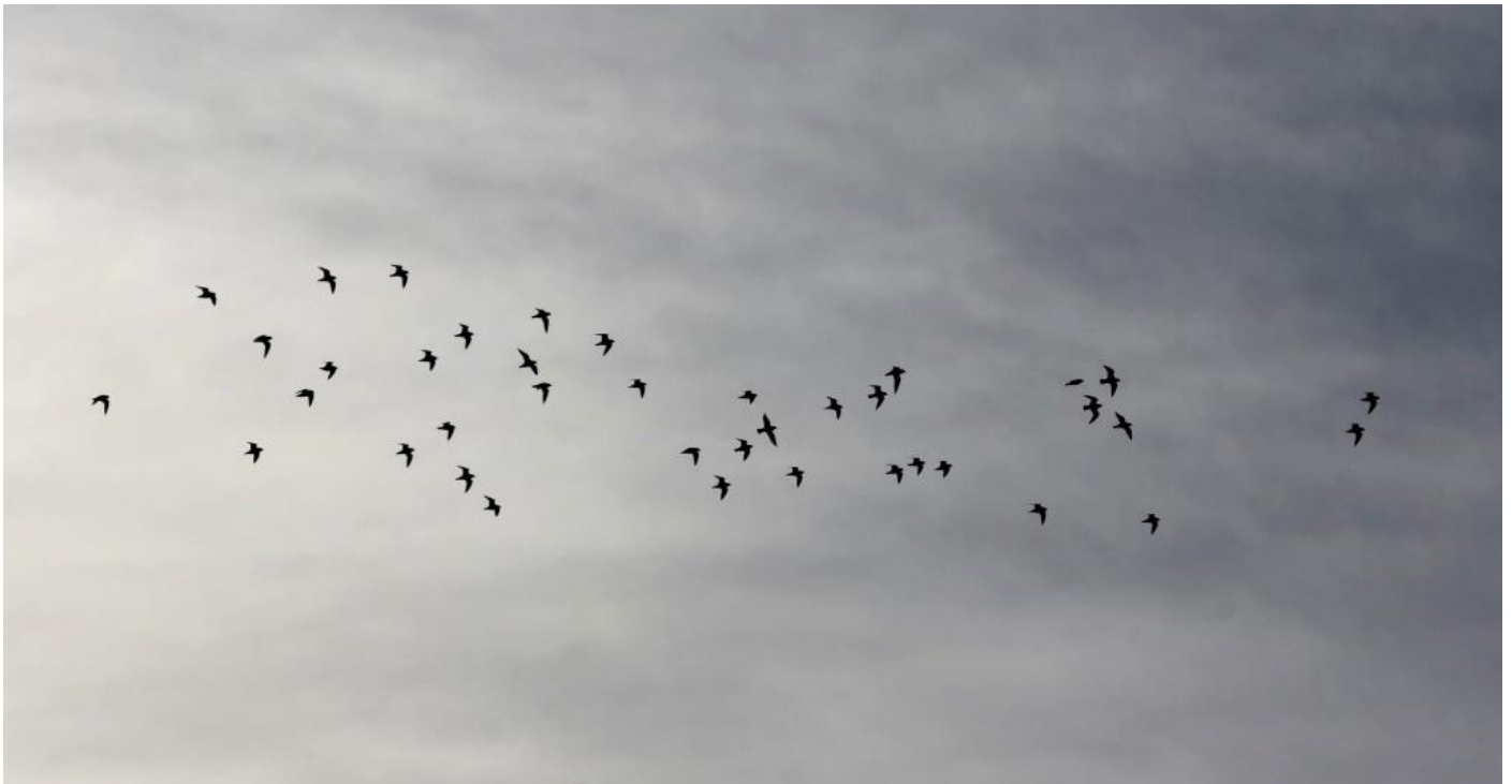
Golden Plovers at Postling Wents