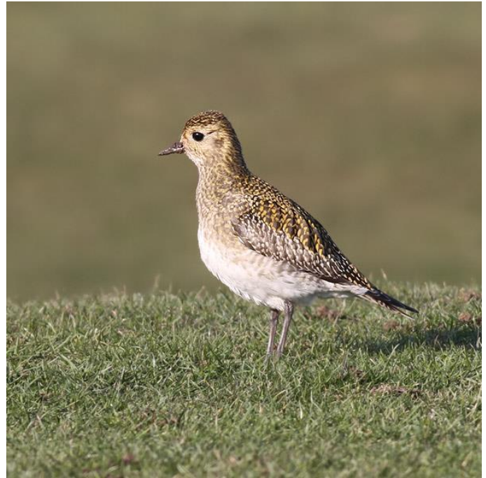
Golden Plover at Hotel Imperial GC (Brian Harper)

It is a widespread passage migrant and winter visitor to Kent.