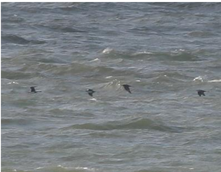
Pomarine Skuas at Copt Point (Ian Roberts)