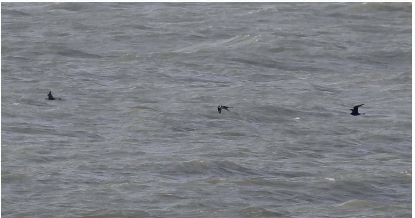
Pomarine Skuas at Mill Point

The tetrad map images were produced from the Ordnance Survey Get-a-map service and are reproduced with kind permission of Ordnance Survey .