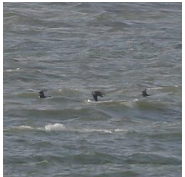
Pomarine Skuas at Copt Point (Ian Roberts)

Figure 2 shows the distribution of all records of Pomarine Skua by tetrad, with records in 5 tetrads (16%).