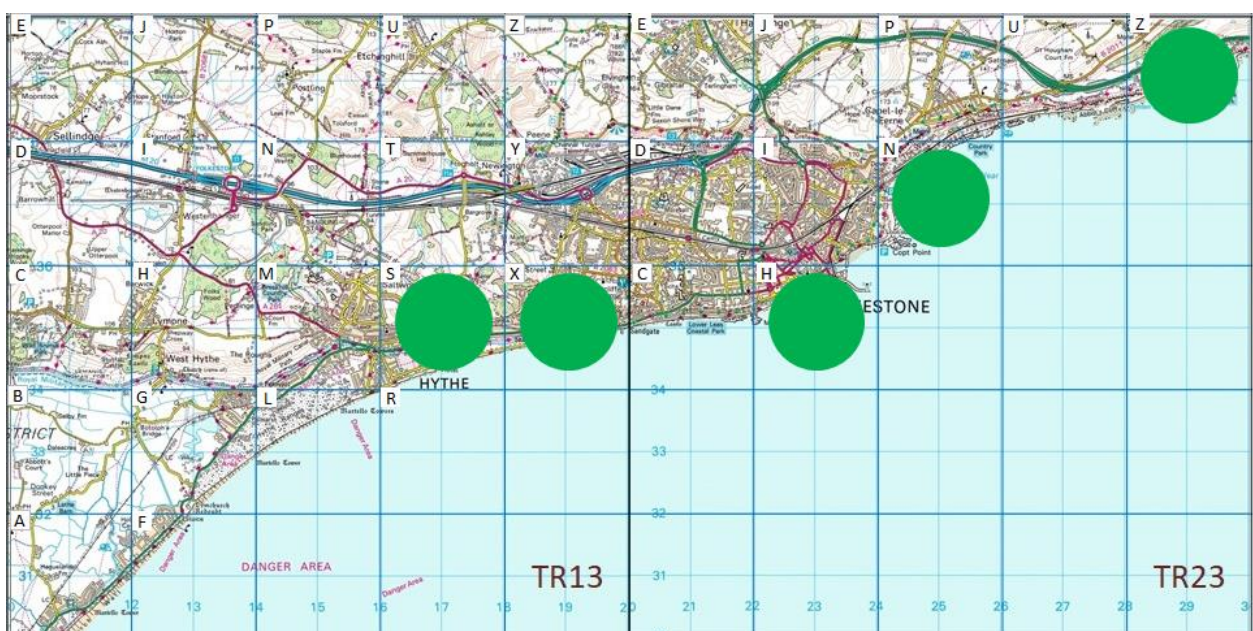
Figure 2: Distribution of all Pomarine Skua records at Folkestone and Hythe by tetrad

Figure 2 shows the distribution of all records of Pomarine Skua by tetrad, with records in 5 tetrads (16%).