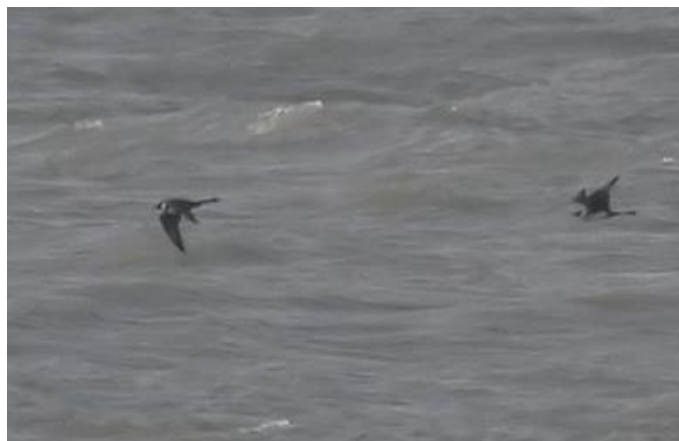
Pomarine Skuas at Mill Point (Brian Harper)

In Kent it is a regular but usually scarce passage migrant and sometimes overwinters in small numbers (KOS, 2020).