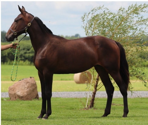
Al-Mar Pure Delight #96