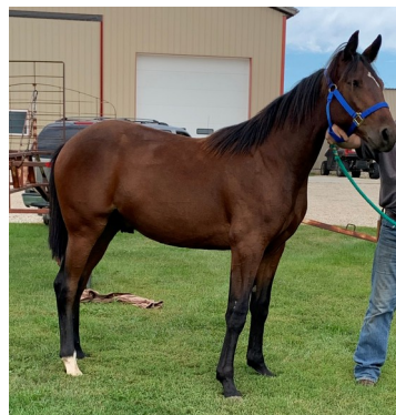
Windupmynight # 59