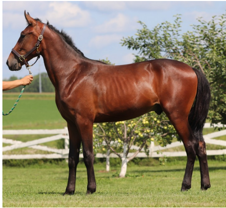
Magical Zamboni #52