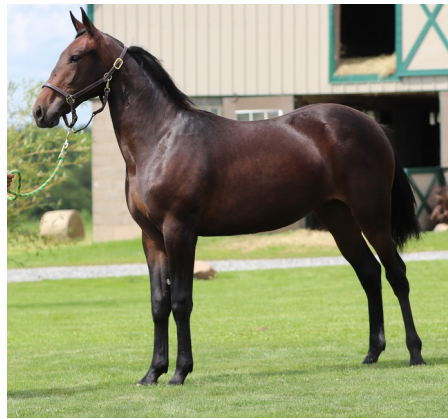
Baby Flash #30