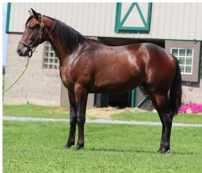
Royal Prospect #68