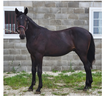
Jetta's Secret #40