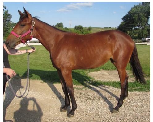
SB Cold Cash #94