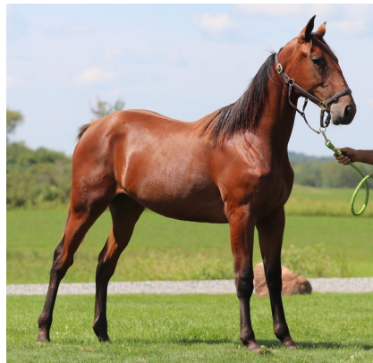
All Roked Kid #3