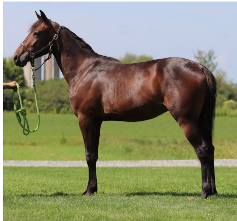
Al-Mar Victorious # 43