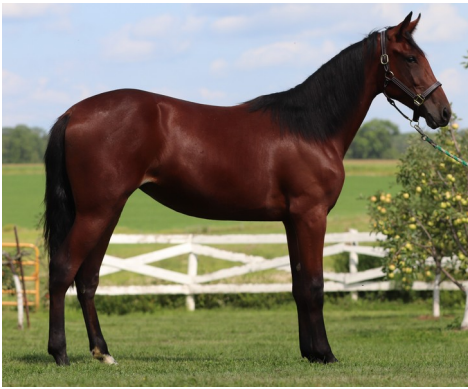
Splendid Dew #28