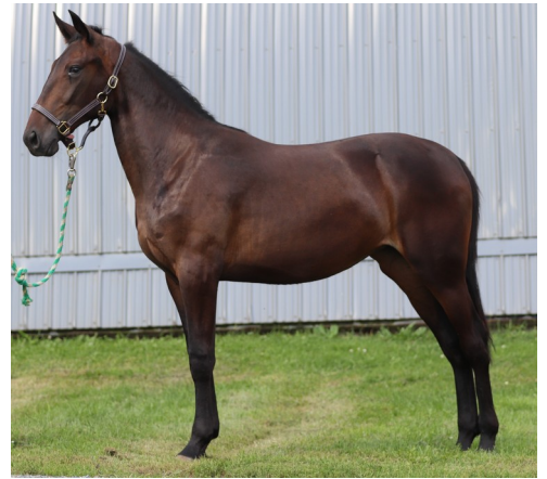
Victory Rails #70