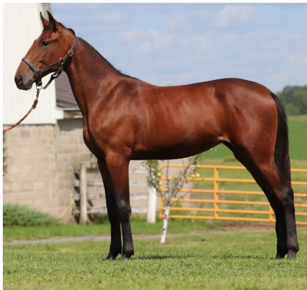
Piggly Wiggly #65