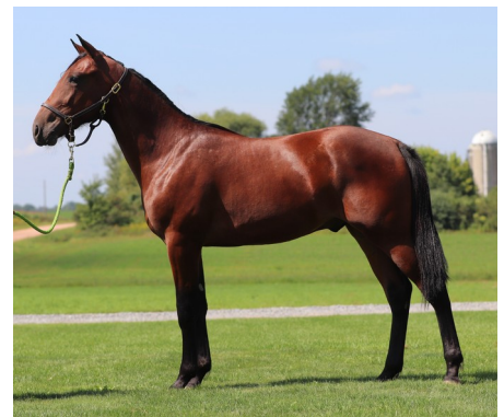
Moon Kid Photo #93