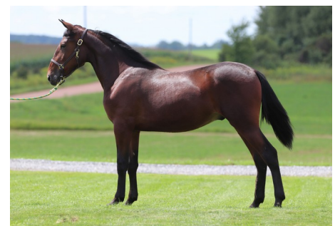
Voltaire Prise #33