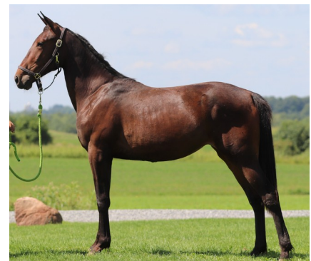
Al-Mar Tootsie #7