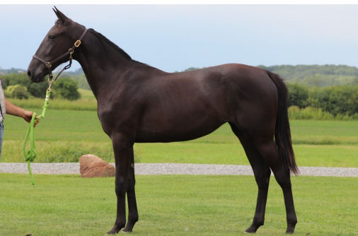
Moonlit Night #26

EXIT 100 – 3 miles north of Cannon Falls on Highway 52 to County Road 86, then take frontage road on west side of HWY 52, 1 mile south.