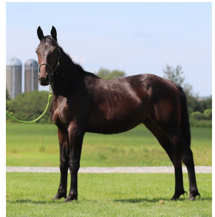
Purple Warrior #53