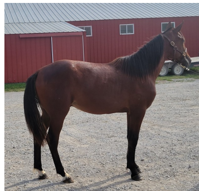
DP Royal Prince #32