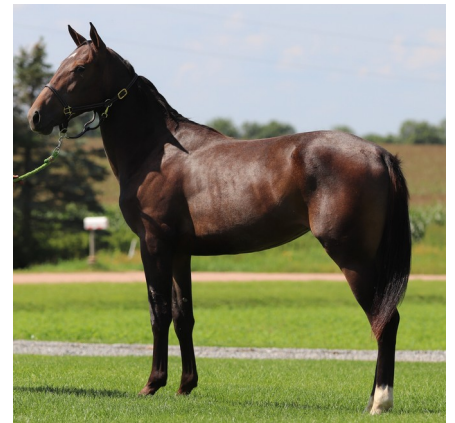
Al-Mar Lil Dazzle #51