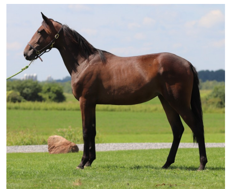
King Over Jet #49