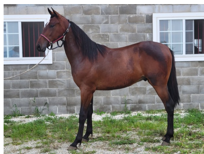
Brag for Royalty #1