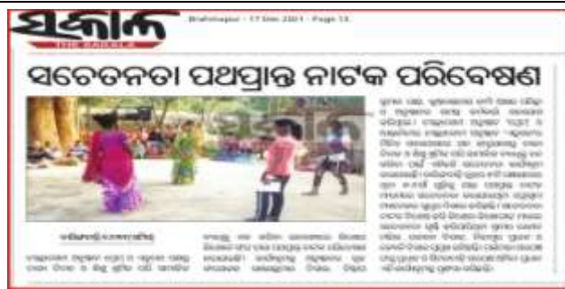
Media clips of community level cultural program performed by the adolescents