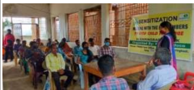
Training for the PRI members to stop child marriage