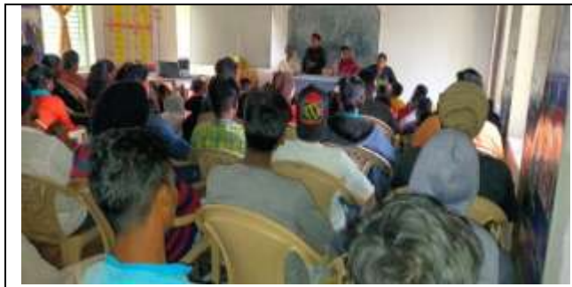
Vocational camp organised for the youths at Daringbadi