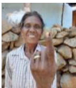
Expressing happiness after casting vote

After receiving the training by PREM-UNFPA, people in most tribal villages of Gajapati district were motivated to participate in the panchayat raj election activity. As a result 100 percentages of all voters of Gundang Gorjang and Dimiripankal model villages exercised their right to franchise.