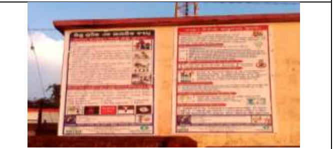
IEC materials on child marriage and child labour displayed at panchayat level of Daringbadi block