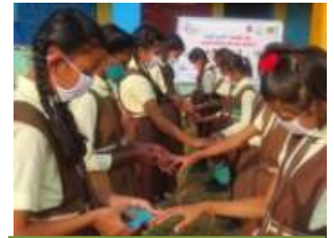
Nail cutting by the school children