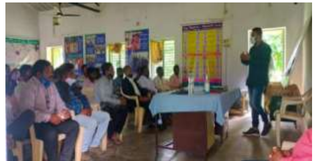
Meeting with religious leaders meeting to stop child marriage