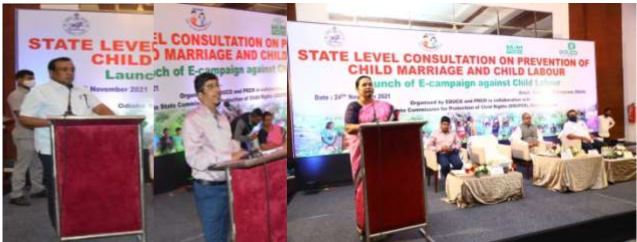
State level consultation on prevention of child marriage and child labour organised at Bhubaneswar