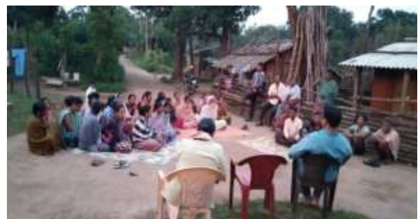
Community level program under Bal Vikah project