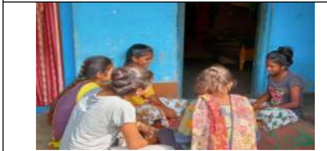
Peer motivating by the adolescents for back to school