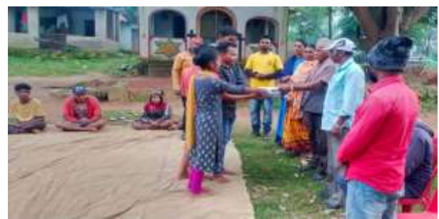
Adolescent presenting their issues to the VCPC members at village level