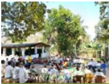
Pre- Election Voter Awareness Campaign

In the ongoing Panchayati Raj elections of Odisha, People's Rural Education Movement (PREM), Berhampur and United Nations Population Fund (UNFPA), Bhubaneswar have jointly undertaken a Pre-Election Voter Awareness Campaign (PEVAC) in seven blocks of Gajapati district during the