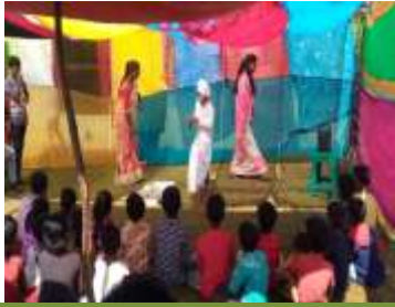
Cultural program by the adolescents

and high school drop outs. Similarly the adolescents are inclined to go for quick money by migrating to other states for labour work which force them to become child labour.