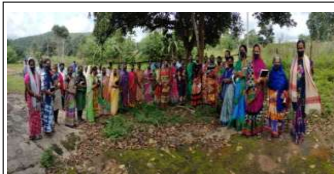
Training for the project staff under Bal Vikash project