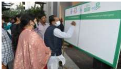
Signature campaign on Say No to Child Labour

Dr. Surjya Narayan Patro, Hon'ble Speaker, Odisha Legislative Assembly also graced the event and launched a digital campaign 'Say No to Child Labour' which aims at bringing together stakeholders