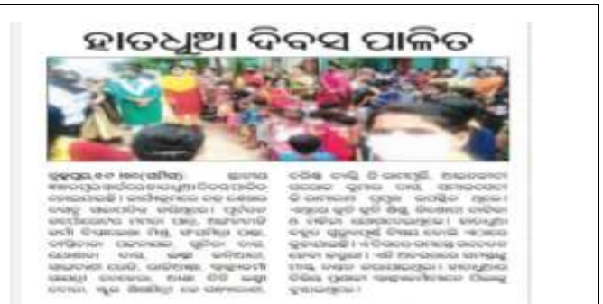
Media clip of Global Hand washing day