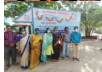
Child right caravan along with Chairman, OSCPCR