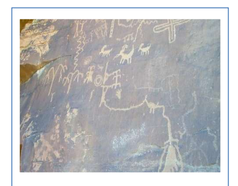
Classic Atlatl Rock

Field schools post-2003 concentrated on areas immediately around and east of the Atlatl Rock outcrop, which is the scene of literally dozens of archaeological sites: rock shelters, campsites, petroglyph and pictograph panels, and historic and modern (20<sup>th</sup> century) sites. The areas included those labeled today as Atlatl Rock, Mouse's Tank and the Cabins. Many of the petroglyphs in this area are within walking distance of these areas. Some display historic carvings by early settlers. Modern archaeological traces such as roads also remain.