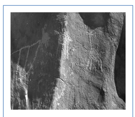
Petroglphs near a rock shelter

Seven survey blocks have been excavated over this period of time. The 2003 season focused on the St. Thomas Wash site on the east side of the park and yielded 14 out of 16 sites (some previously recorded by Shutler and Shutler, 1962). Three of these sites were discussed. They typically consisted of overhangs and rock shelters with accompanying lithics including arrow points, and a series of petroglyph panels in or around the shelters.