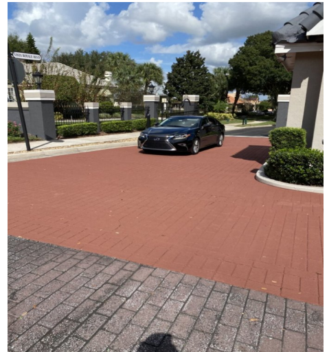
REFURBISHED STAMPED ASPHALT