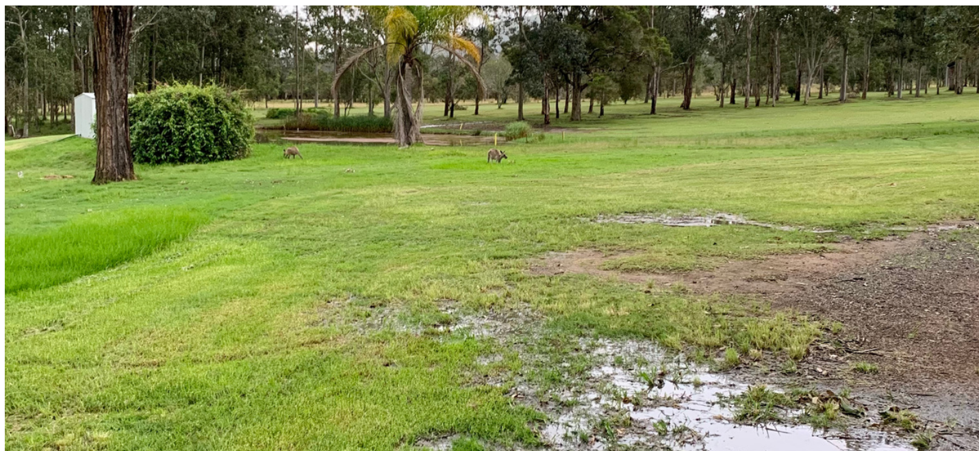
Pictured | Looking across towards the 8th dam.