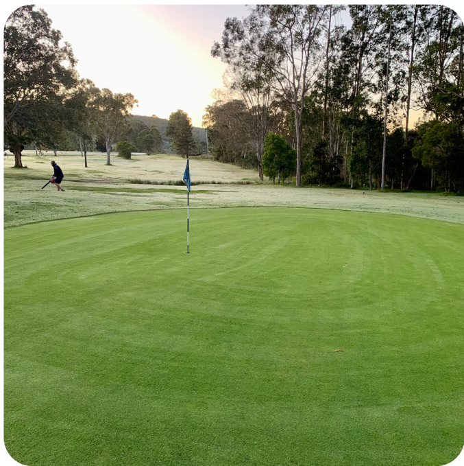
Pictured | Looking back down the 2nd on a crisp May morning.