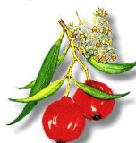
'Quandong' painted by Rosemary Pedler