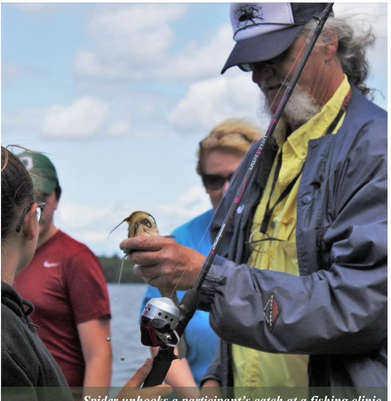
Spider unhooks a participant's catch at a fishing clinic