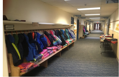
The Coats for Kids Collection. Drive: Over 100 coats were donated - 90% were new with tags! The Knights of Columbus donated 48 coats. The rest came from the generosity of our parish.