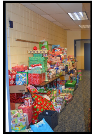
Bethlehem Tree gifts

In this twenty-fifth issue of the Parish Pipeline , some of our ministries have updated their activities. Immaculate Conception is fortunate to have many more ministries which will be highlighted in coming issues. For a complete list of ministries,