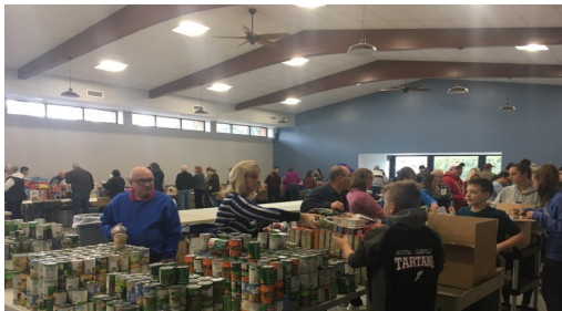
Thanksgiving Food Drive