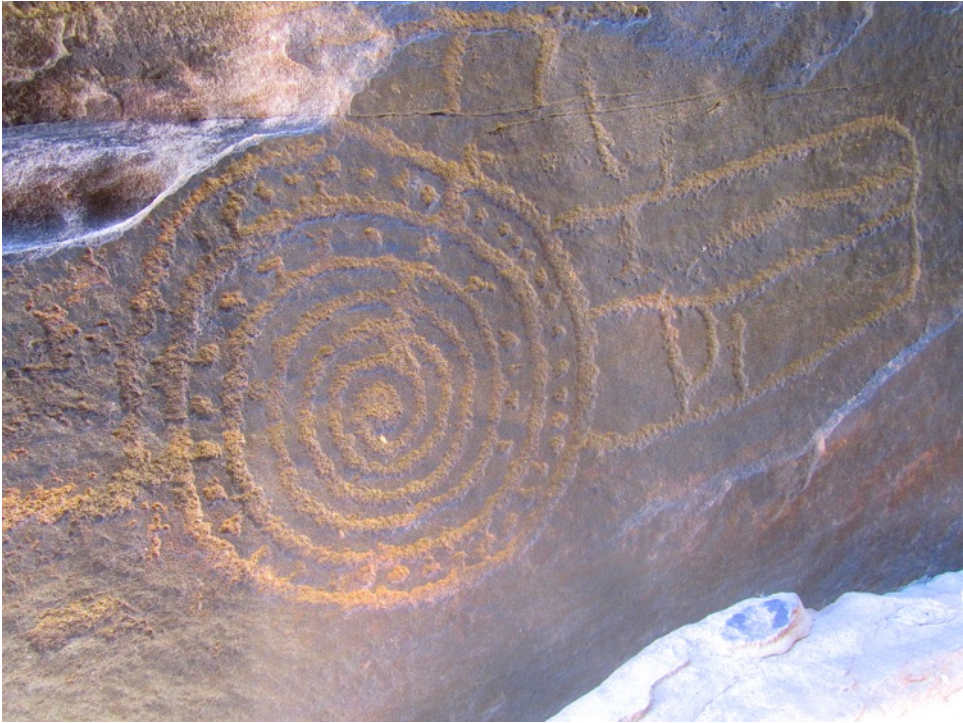
The Tonaquint site. This site is thought to be a solstice marker. Go to <u>http://dixierockart.webs.com/Technical%20Presentations/Tonaquint%20Terrace%20Glyp hs%20April%203%20from%20Karen%20v2.1,%202013.pdf</u> to see more about the solar interactions at the site.