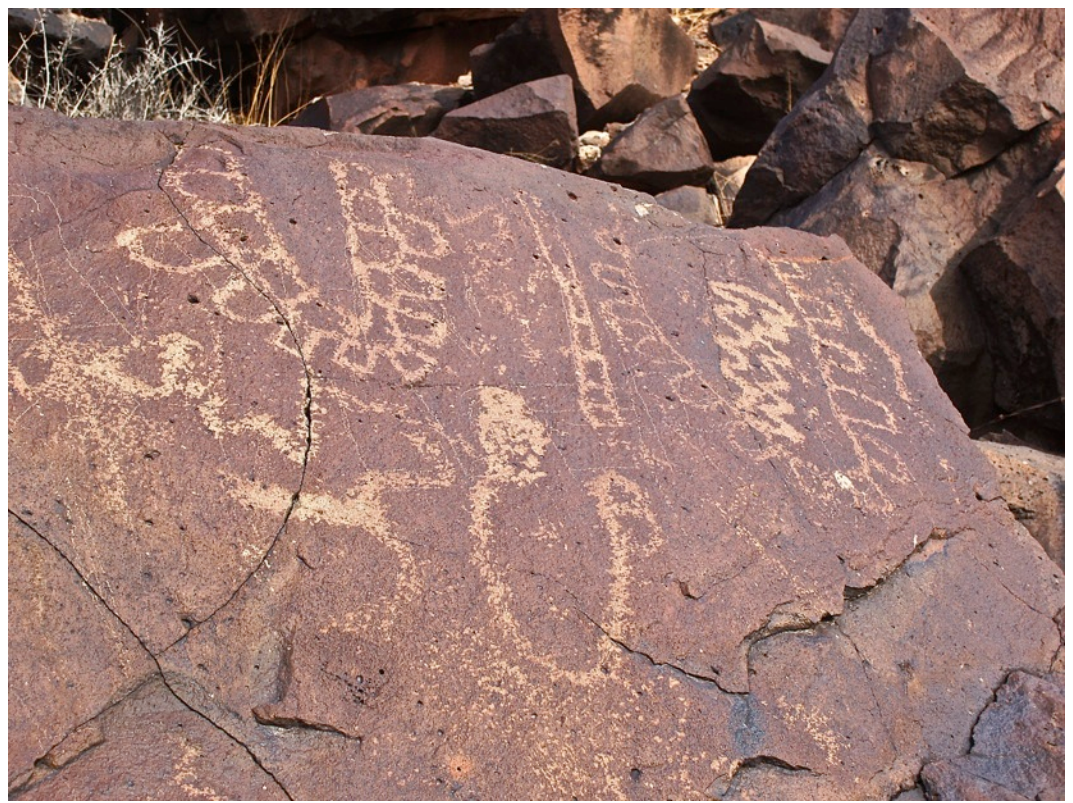
The Maverick site noted for the large number of "necklace" style glyphs.

For more images from these sites, go to <u>http://dixierockart.webs.com/Field%20Trip%20Reports/Tour%20of%20St%20George.pd</u> \underline{f} .