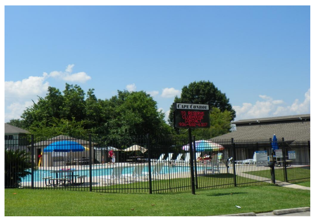
THE POOL IS OPEN 10:00 am - 9:00pm Tuesday thru Sunday Closes October 1st

The Cape Conroe Pool is open! The hours are 10 a.m. to 9 p.m. Closed on Monday every week, unless it is a holiday.