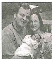
Dedicated to New Families

*Cesarean data based on Virginia Health Information, Inc., 2007.