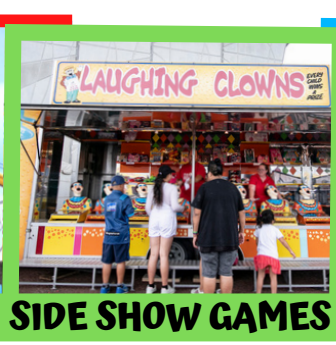
SIDE SHOW GAMES