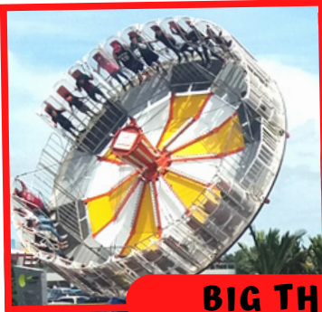
BIG THRILL RIDES

FREE ENTRY FREE PARKING FREE RIDES FREE ENTERTAINMENT FREE FACEPAINTING