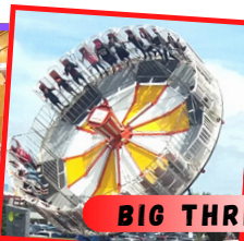
BIG THRILL RIDES