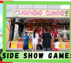
SIDE SHOW GAMES