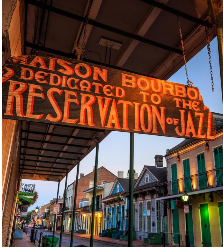
5 Days 🗸 Meals: 4 Breakfasts, 1 Lunch, 2 Dinners

HIGHLIGHTS... French Quarter, Hermann-Grima Historic House, New Orleans School of Cooking, Celebration in the Oaks Holiday Lights, National World War II Museum, Victory Belles Holiday Musical Revue, Reveillon Dinner at The Court of Two Sisters