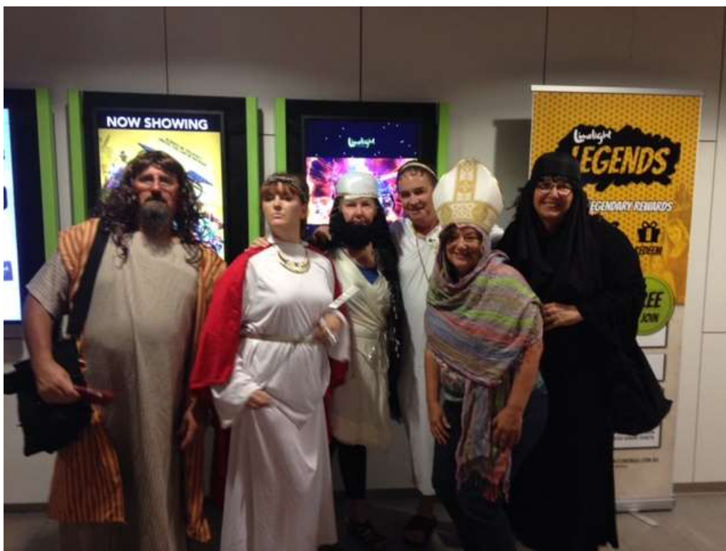
Life of Brian Night

Information nights: First Friday of every month, held at Ipswich Country Club, 1a Samford Road, Leichardt.