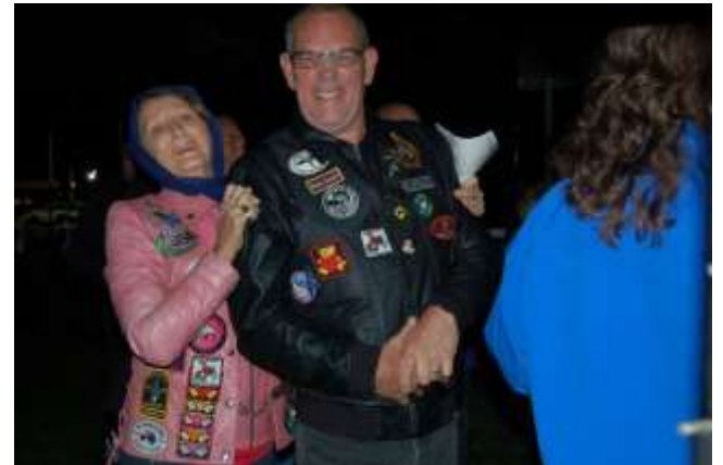
ANZAC Day Dawn Service , Bundamba Memorial Park