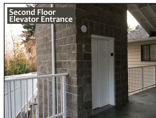
Second Floor Elevator Entrance