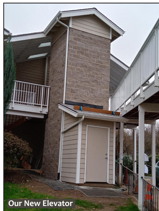
Our New Elevator