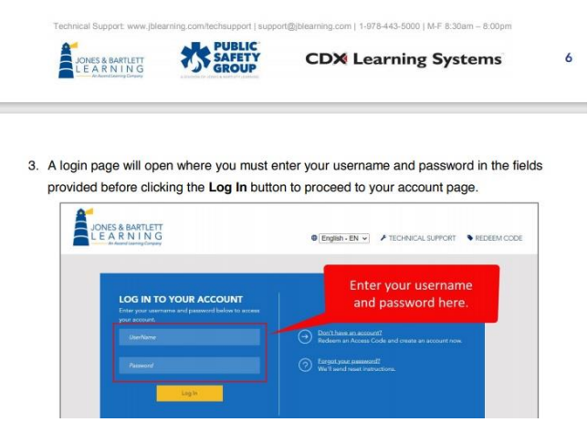
A view of J & B's Navigate Training Manual, one of the resources discussed at Friday's workshop.

Participants in Track A (Instructor Development) met via Zoom Friday afternoon for a workshop conducted