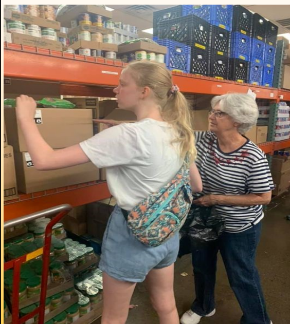
Trinity Youth Mission Work

Parent's Night Out will resume beginning Friday, Aug. 27 from 5:00pm-9:30pm. Activities will mainly be outside and we will be monitoring current school and other Covid protocols to ensure we provide a safe environment for our children while giving our parents a much-needed night off.