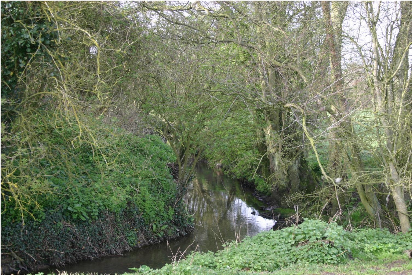
The East Stour River