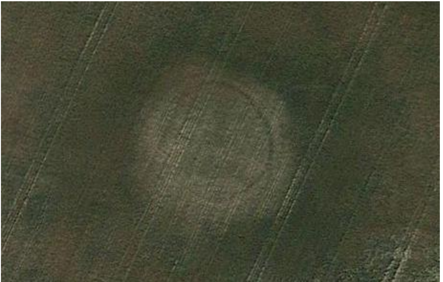
Tumulus near Burnbrae Farm

Natural England no date. Otterpool Quarry SSSI designation: https://designatedsites.naturalengland.org.uk/PDFsForWeb/Citation/1003173.pdf