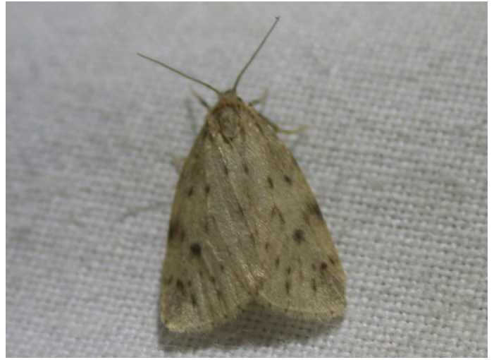
Round-winged Muslin at East Stour