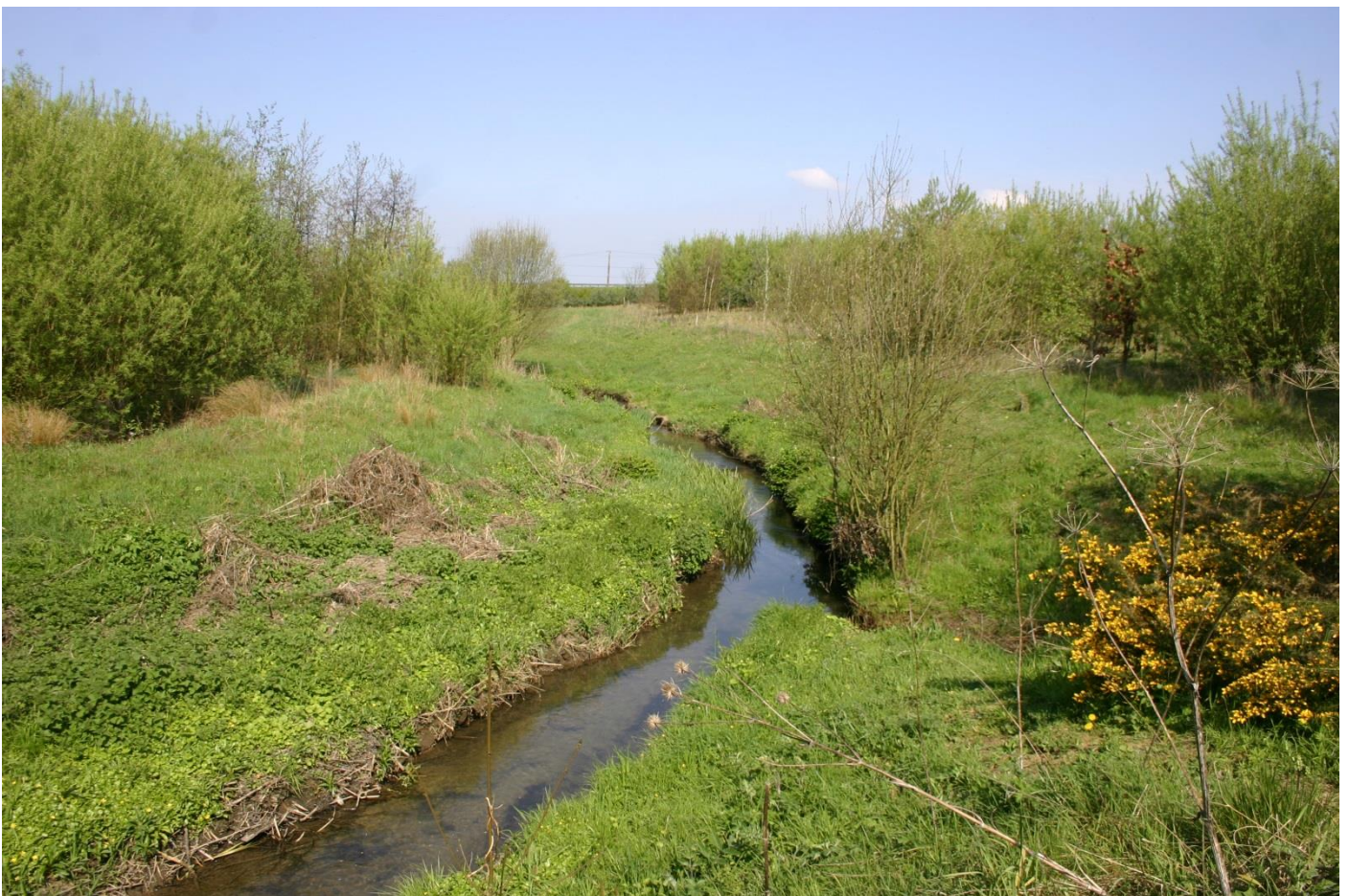
Habitat between the railway and motorway