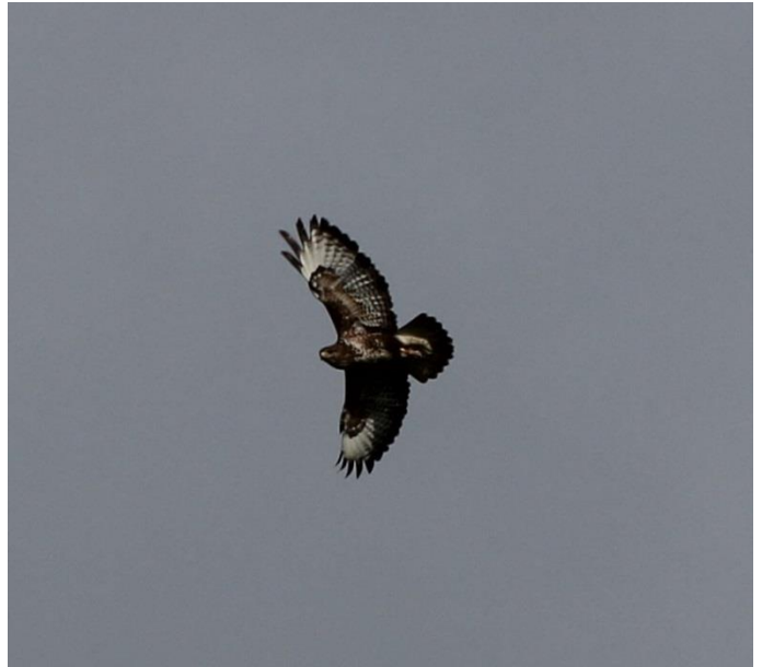
Buzzard near Burnbrae

In winter Fieldfare and Redwing may be found in the fields, whilst the streams have attracted Little Egret, Snipe and, Grey Wagtail, with Siskin and occasionally Lesser Redpoll in the alders along the East Stour River. Corn Bunting may be present if winter stubble is left and Red Kite, Peregrine, Merlin and Waxwing have also occurred.