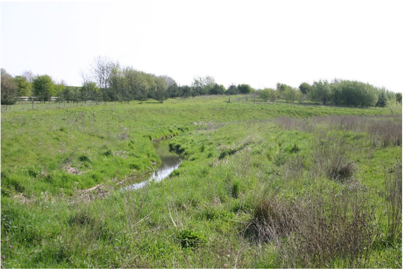
Habitat between the railway and motorway