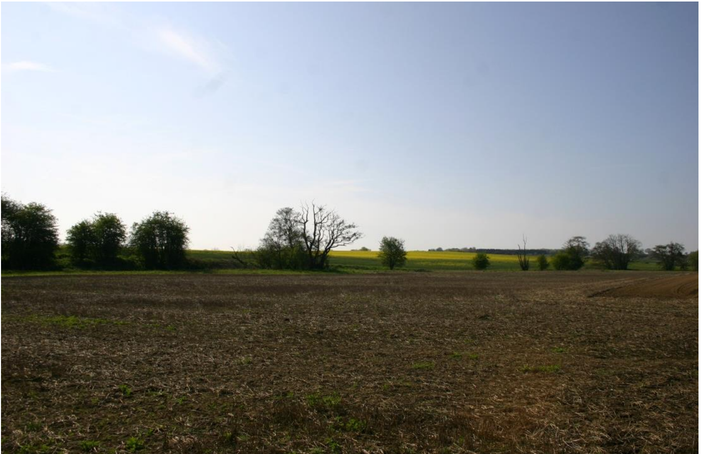
Looking south-west towards Burnbrae from the railway