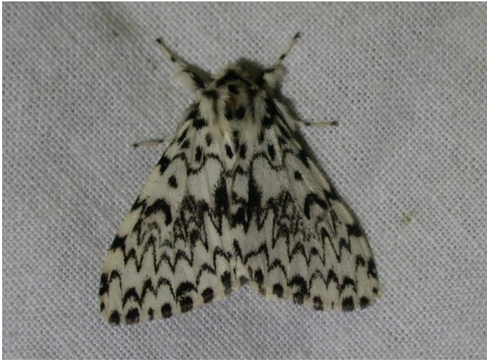
Black Arches at East Stour