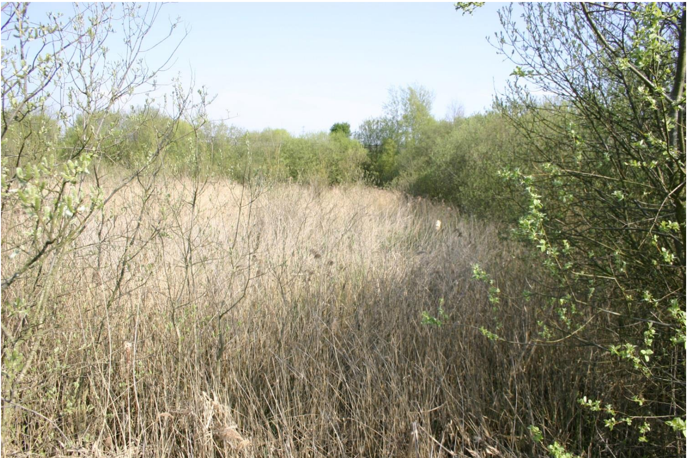
The most northerly lake