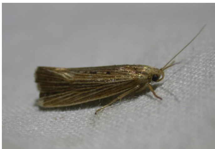
Orthotelia sparganella at East Stour

A number of insect groups in particular have received very little attention here and there is clear potential to extend several of the lists that are given below. The moth list is primarily derived from a single night of trapping on the 11 th July 2019 which produced 108 species, including Orthotelia sparganella (Reed Fanner), Bisigna procerella (Kent Tubic), Catoptria falsella (Chequered Grass-veneer), Large Emerald, Black Arches, Round-winged Muslin, Beautiful Hook-tip and Dingy Shears.