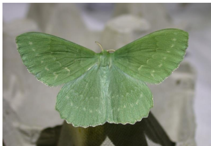
Large Emerald at East Stour

The former workings at Otterpool Quarry have been designated as an SSSI due to their geological significance. The quarry shows the finest section through the Cretaceous Hythe Beds in East Kent and is of particular significance in showing the contact between this formation and the Sandgate Beds above. The Hythe Beds are especially fossiliferous at this locality and are unusually rich in certain ammonites. It is a key stratigraphic locality, both for the formations it exposes and its correlatable ammonite faunas.