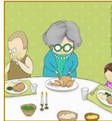
The Bobbins discover that quilt batting is a poor substitute for turkey stuffing.