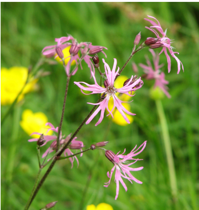
Ragged Robin and Buttercups