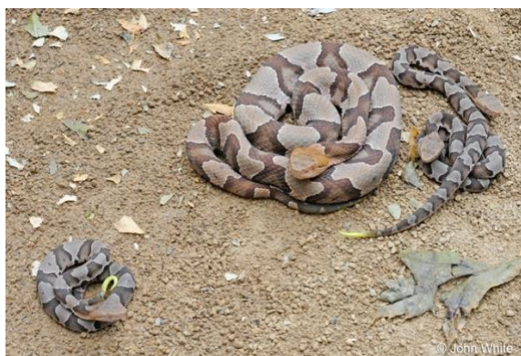
Juvenile and Adult

Additional information may be found in the bibliography at the end of the publication.