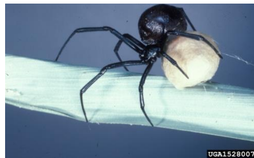
Southern black widow with egg sac

Additional information may be found in the bibliography at the end of the publication.