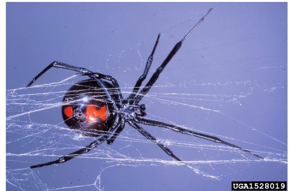
Southern black widow

The female black widow bites and injects a venom, a neurotoxin called alpha-latrotoxin . The venom causes a massive release of chemicals in the victim that leads to intense muscle spasms and pain. If