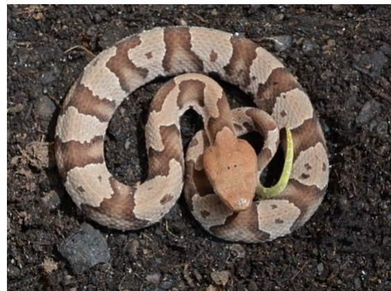
Juvenile