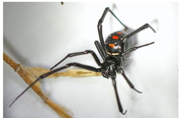
Northern black widow