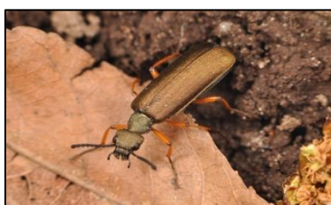
Bronze blister beetle