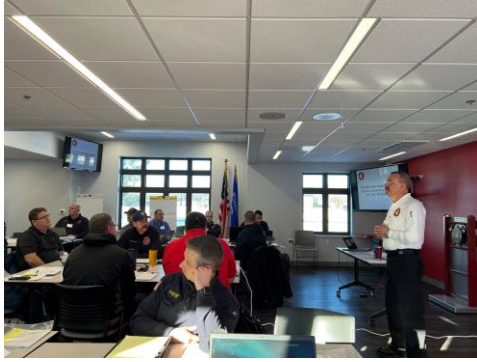
ISFSI instructors convene the Live Fire classroom session.

exercises and practiced inspections of personal protective equipment (PPE) as part of the safety requirements of the standard. The class also conducted an on-site walk-through of FDLFR's training burn facility.