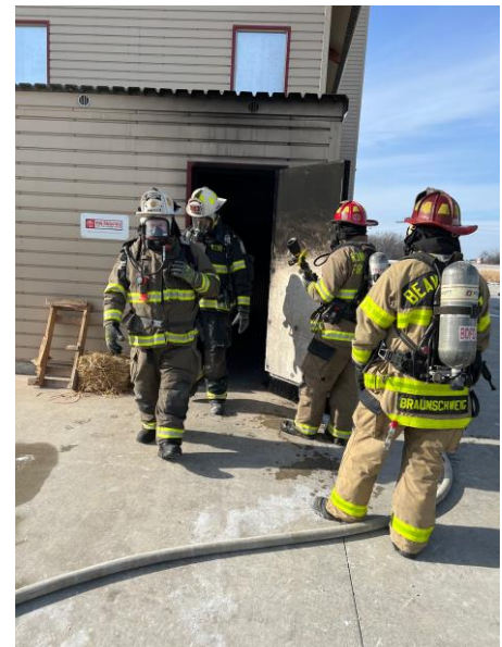
NFPA 1403 class conducting fixed facility live fire evolutions.