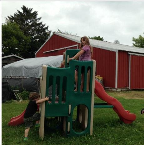
The kids made good use of the playground equipment.