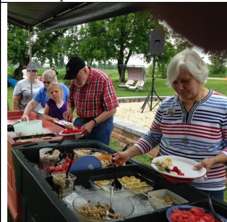
Ahh, the food line! We had plenty to enjoy.