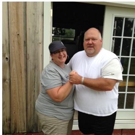
Team AND candidate applications available on the website