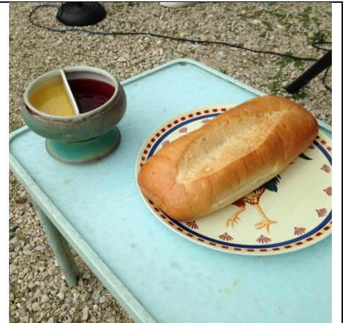
The bread, the wine – taken in remembrance of Him.