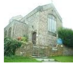
Our Lady of Lourdes