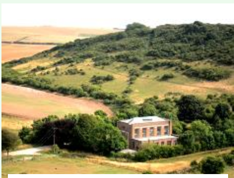
Balsdean Pumping Station

Finally we made it to the end of the trail and now we were admiring the