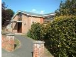
St. Patrick's Church

Broad Green/Cowley Drive Woodingdean BN2 6TB