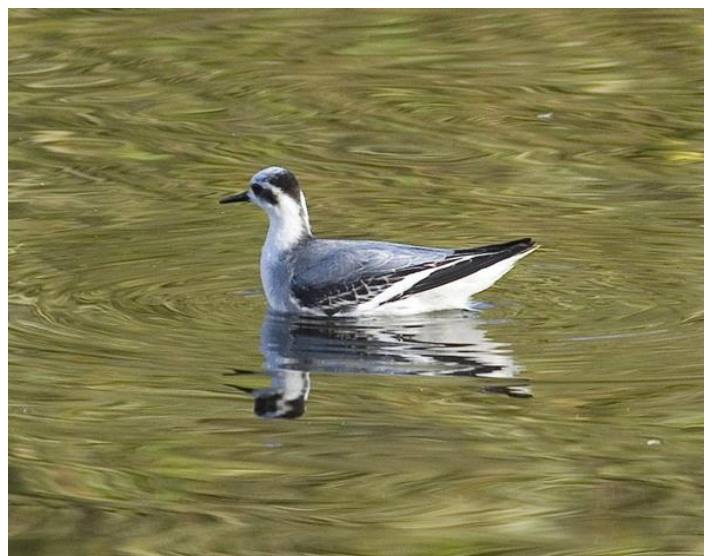
Grey Phalarope at West Hythe (Mike Terry)