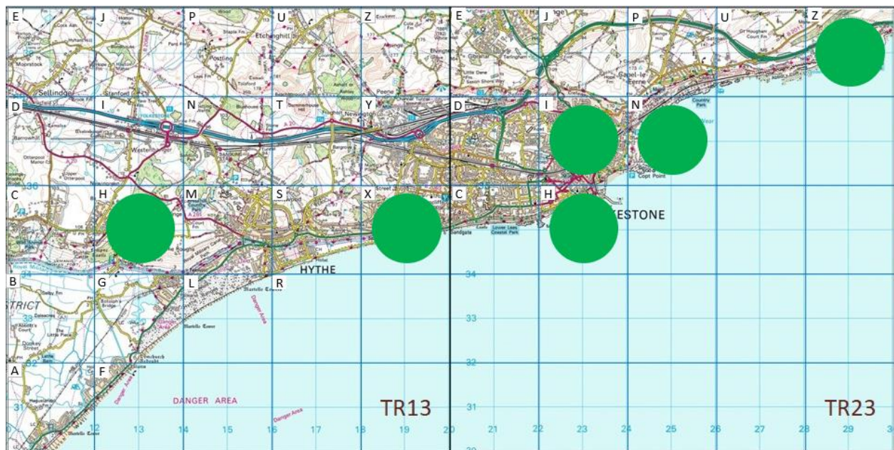
Figure 3: Distribution of all Grey Phalarope records at Folkestone and Hythe by tetrad

Figure 3 shows the location of records by tetrad.