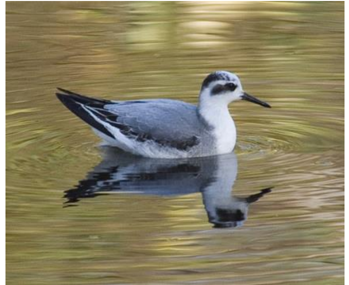
Grey Phalarope at West Hythe (Mike Terry)

It is a scarce autumn and winter migrant in Kent.