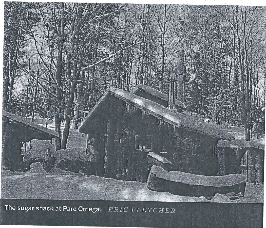
The sugar shack at Parc Omega. ERIC FLETCHER

Head to Chez Ti-Mousse via Highway 50 and stay on it to exit 197 north. In 500 metres turn right onto Côte des Cascades; continue one kilometre to turn right onto Côte St. Charles. Ti-Mousse is about three kilometres south, on your left. Parking is free. Tip? Ti-Mousse advises go for brunch in early afternoon, avoiding the earlier morning lineup.