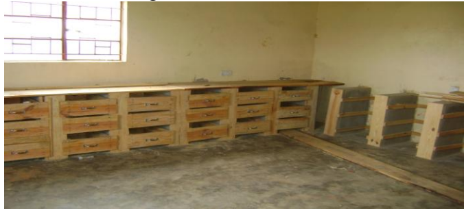
Laundry drawers & ironing board

Drawers and ironing Cupboards are in the process of being made. Children and Care givers will be expected to be ironing from here when all work is finished.