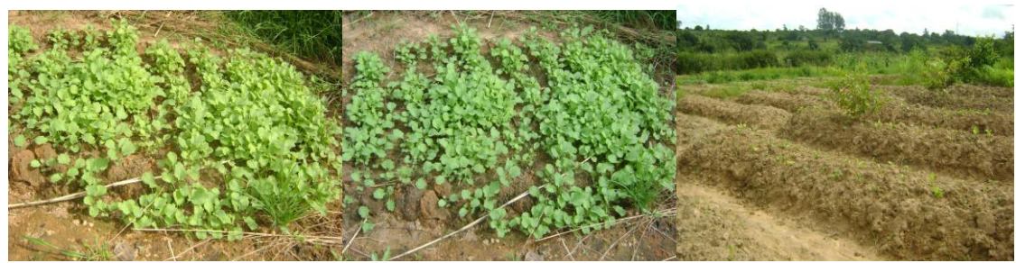
A little something on gardening

In truth, garden is poorly managed this time. Excuses have been that vegetables do not do well in rainy season but the out-look and the cleanliness of the garden does not engulf the excuse. An appropriate decision is expected to be made in order to improve the garden condition. Currently, fish, ducks and chicken are there at the garden site and are doing well but the surrounding is not very clean. Some nursery is almost ready now for a second trial.