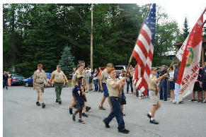
The Clifton-Fine Scouts march proudly in the 2014 parade.

This year all proceeds went to the fund to rebuild the footbridge. Proceeds for the day included money from: Bossie Bingo, Baked beans contest, Hot Dogs for the bridge, Donation jar and the Laquay kids' (Bernie & Blanche Siskavich's grand-