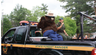
Smokey The Bear arrives on the NYS Ranger's truck.

children) parade stand. a great community we in!!!