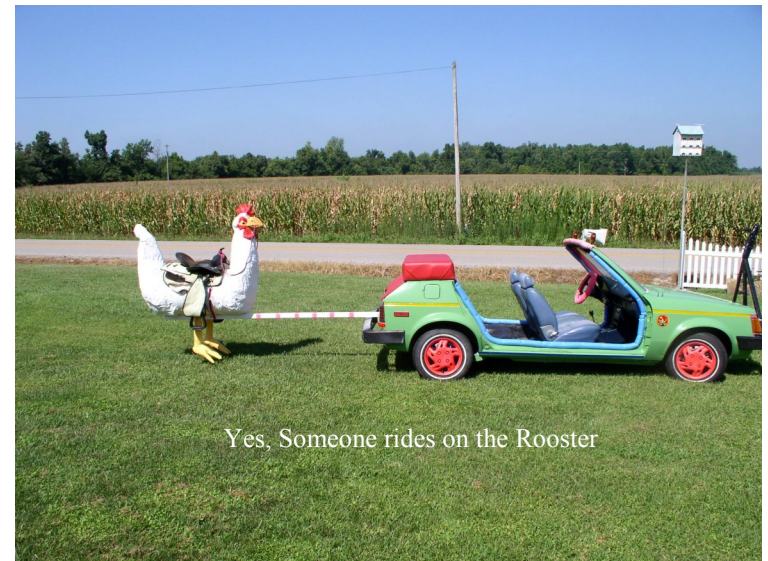
Yes, Someone rides on the Rooster