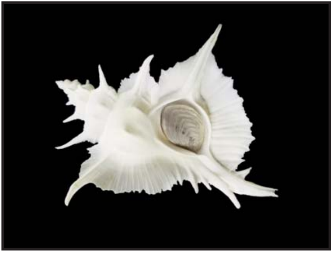
A Siratus alabaster in the Editor's collection.

two or three rather conspicuous nodules; three -varicose, varices, laminately winged, furnished at the angle with an erect deeply canaliculated tubercle; ivory white within and without; canal rather short."