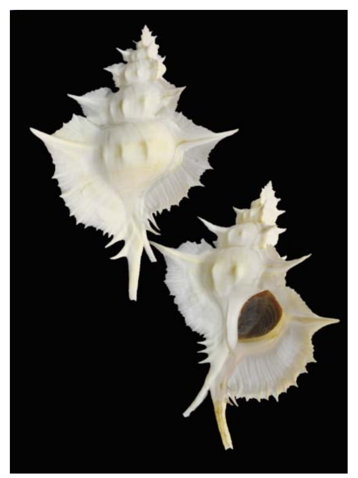
The Siratus alabaster or Alabaster Murex.

"Shell triangulary fusiform, spire equal to the length of the shell, whorls transversely ridged and striated, ridges smooth, angulated at the upper part, armed at the angle with