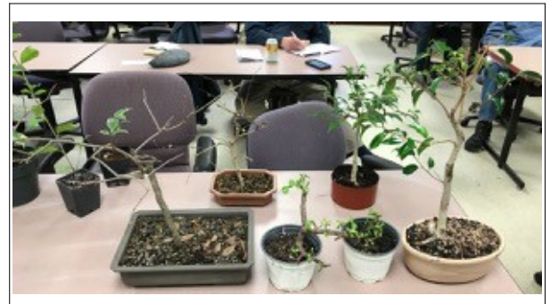
A few of the trees that found new homes at the January meeting.

The January meeting was well attended and a couple dozen trees changed hands. Many thanks to everyone who brought a tree. If you take a photo of the tree as you improve it, please forward and I'll include it in a future Newsletter.