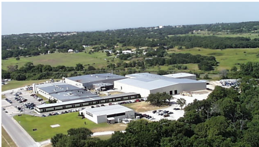
Weatherford, Texas facility just west of the Dallas / Fort Worth Metroplex

Jamak is a TS 16949, ISO 9001/2000, ISO 14001 Certified Company Call 1-800-395-2625 extension 2517 or 5218 Visit – www.jamak.com