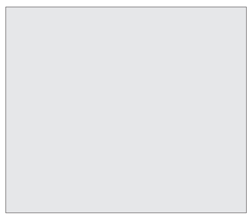
Plate 2 Mount Alexander windmill, Grenada, 1773.

Grenada.<sup>88</sup> The Harveys gradually controlled various plantations including Morne Fendue, Chambord, Plains, and Upper and Lower Conference.<sup>89</sup> By the mid-nineteenth century, Glasgow's sugar merchant-planters were an elite group, dubbed the city's 'Old West Indians'.<sup>90</sup>