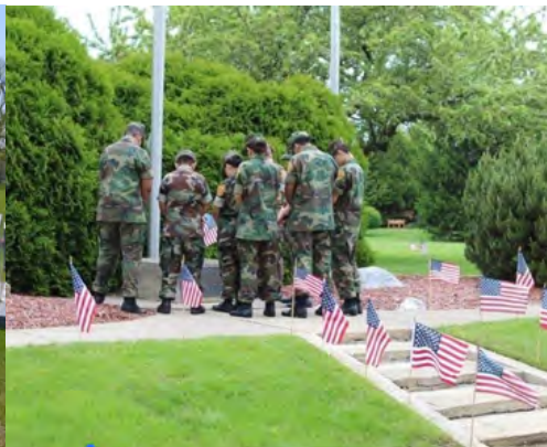
Young Marines praying for those who've fallen for our country