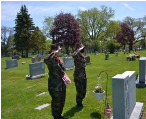
Lake County Young Marines placed flags on memorials at Warren Township Cemetery and Highland Memorial Cemetery

Memorial Day is a day to honor those who've made the ultimate sacrifice for our country. This day is looked upon by many who are thankful for those that haven't made it back from the battlefields. In recognition of "those" who have made that sacrifice, it is our duty as Young Marines of the nation to keep them in memory; whether that be placing flags on memorials, holding a ceremony, or simply reflecting upon the heroes that allowed us to deliver our freedoms. Fortunate for us, our nation has a day in place to remember these heroes, and it allows us to reflect on the selfless sacrifice that each man and woman made for our country. This day isn't a day planned for family barbeques, store discounts, or a day off from school. It is a day to honor the fallen that helped fight to keep our country free. Young Marine units around the division have come together to remember our heroes on Memorial Day, 2020.