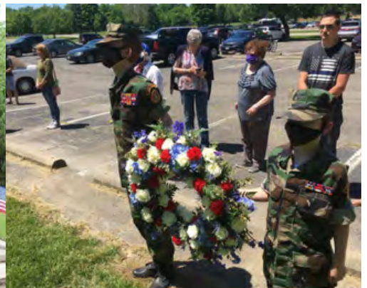
Young Marines placing a wreath on a memorial