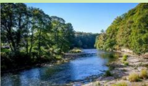
River Wear near Finchdale Priory