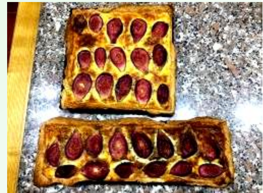
It’s fig and damson week here. Using every baking tray – cheese, herb and fig in shortcrust pastry. Some for sale on Sunday, with new damson jam! - Irene