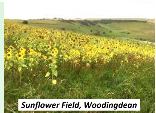
Sunflower Field, Woodingdean

Groups or individuals can apply to hire St Patrick’s for classes and events. They have to provide risk assessments and agree with St Patrick’s about procedures to minimise Covid spread, these include reduced numbers indoors, significant air movement from open windows and doors, social distancing of participants and mask wearing. St Patrick’s then has to apply to the Diocesan Office with their checklist for hiring to that group or person. Volunteers make it all work. It takes infinitely more time than one can imagine.